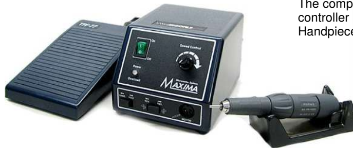
Table micromotor ARGOFILE.