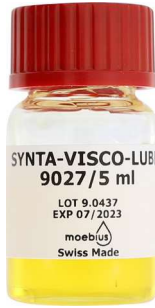
Moebius Synta-Visco-Lube 9027