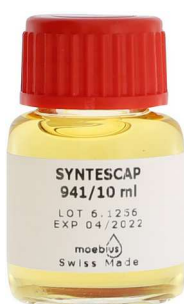
Moebius Syntescap 941