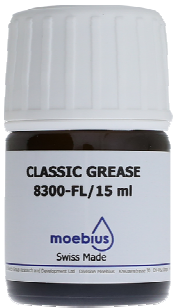
--- 8300-FL fluorescent