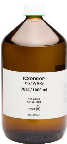
Moebius Fixodrop WR-S