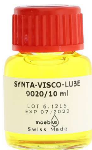
Moebius Synt-Visco-Lube 9020