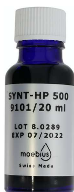
Moebius Synt-HP 500 (9101)