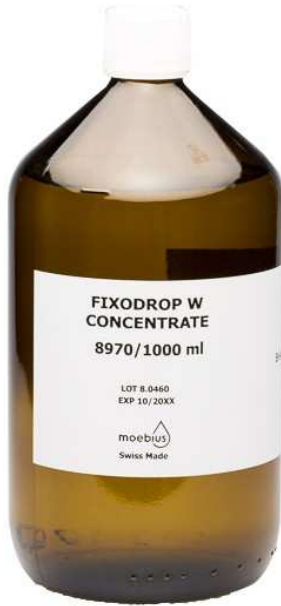
Moebius Fixodrop W