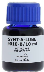
--- 9010-B dark blue