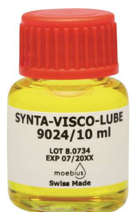
Moebius Synta-Visco-Lube 9024.