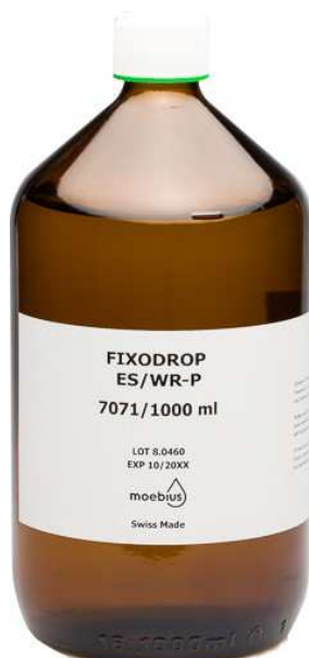
Moebius Fixodrop WR-P