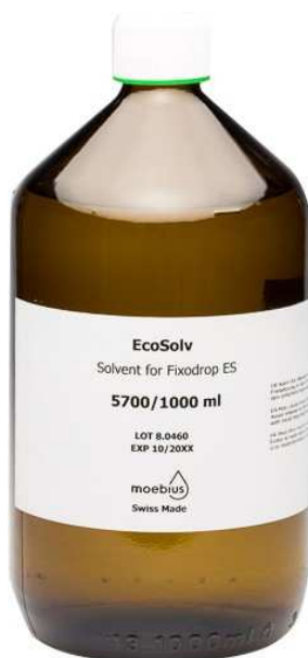
Moebius solvent for Fixodrop