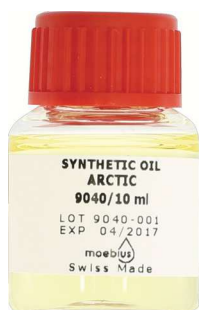
Moebius Arctic 9040