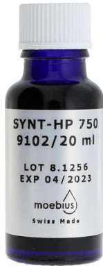
Moebius Synt-HP 750 (9102)