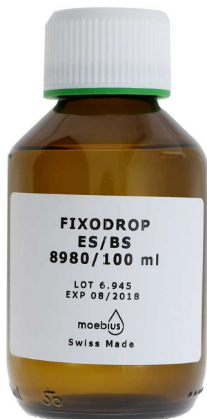
Moebius Fixodrop BS