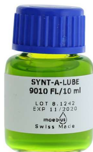
9010-FL fluorescent ---