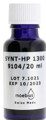
Moebius Synt-HP 1300 (9104)