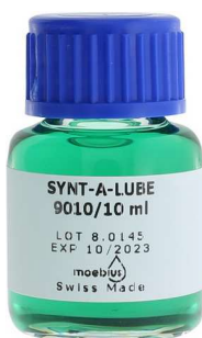
Moebius Synt-A-Lube 9010 - 9014