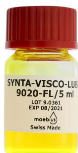
--- 9020-FL fluorescent