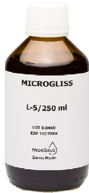
Moebius Microgliss L5