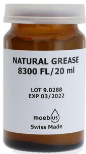
--- 8300-FL fluorescent