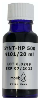
Moebius Synt-HP 500 (9101)