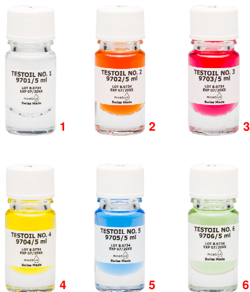
Moebius test oil