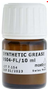
--- 9504-FL fluorescent