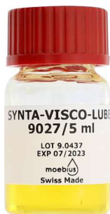
Moebius Synta-Visco-Lube 9027