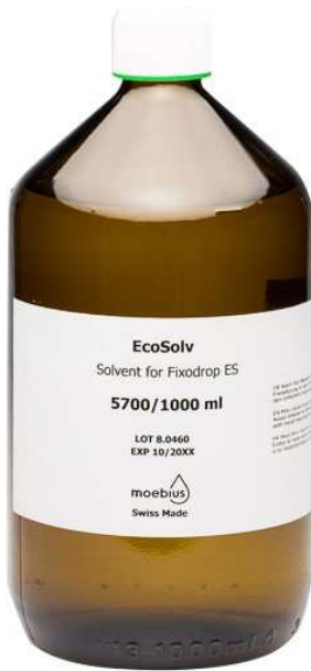
Moebius solvent for Fixodrop