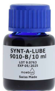
--- 9010-B dark blue