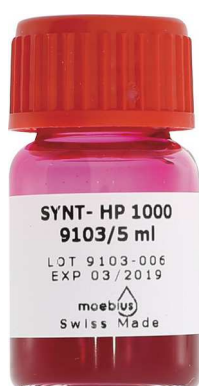
Moebius Synt-HP 1000 (9103)