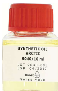
Moebius Arctic 9040