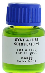
9010-FL fluorescent ---