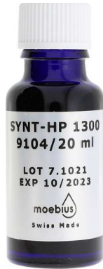
Moebius Synt-HP 1300 (9104)