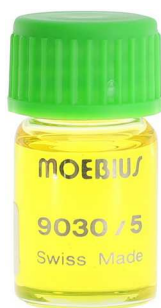
Moebius Synt-Frigo-Lube 9030