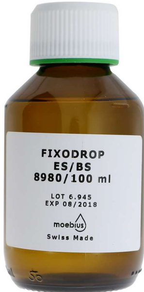
Moebius Fixodrop BS