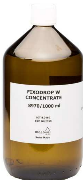
Moebius Fixodrop W