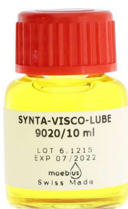
Moebius Synt-Visco-Lube 9020