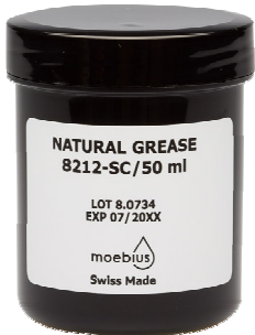
-- 8212-SC colourfree