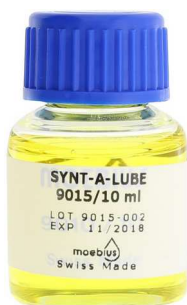
Moebius Synt-A-Lube 9015