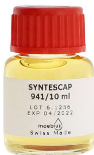
Moebius Syntescap 941