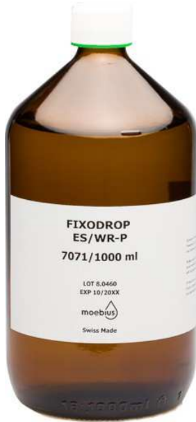
Moebius Fixodrop WR-P