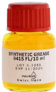
--- 9415-FL fluorescent

100% synthetic soft thixotropic grease presenting an excellent stability and a very good lubricity allowing effective wear reduction. Specially developed for the lubrication of the escapement, it allows the formation of an efficient lubrication film. For micromechanics, it is used in the following areas : miniature ball bearings, step-by-step motors, high frequencies, synchronies, etc. Yellow aspect.