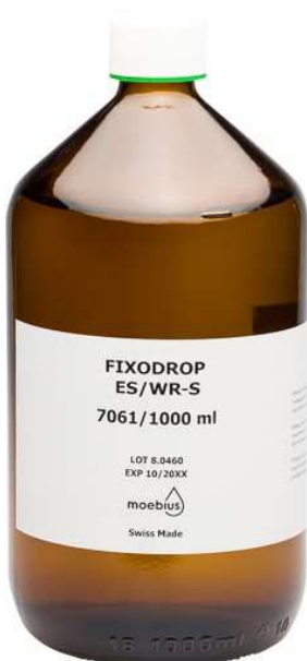
Moebius Fixodrop WR-S