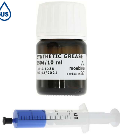
Moebius 9504 * Syringe