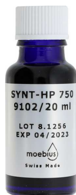
Moebius Synt-HP 750 (9102)