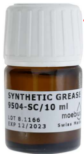
--- 9504-SC colourless