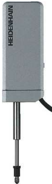
Travel 12 or 25 mm