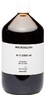
Moebius Microgliss K-7