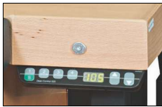
Electrical adjustment :