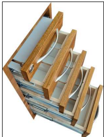
30.5 x 41.5 x 62.5 mm